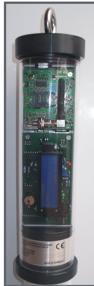
Back view with display

ECH Elektrochemie Halle GmbH Otto-Eissfeldt-Str. 8 D-06120 Halle (Saale) Germany Tel.: +49 345 279570-0 Fax: +49 345 279570-99 E-mail: info@ech.de Website: www.ech.de