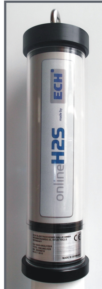
OnlineH 2 S as portable appliance

The measuring range is varied over a wide area and to adapt to the application. The measurement results can be transferred into the management system via digital (alarm) and analog outputs.