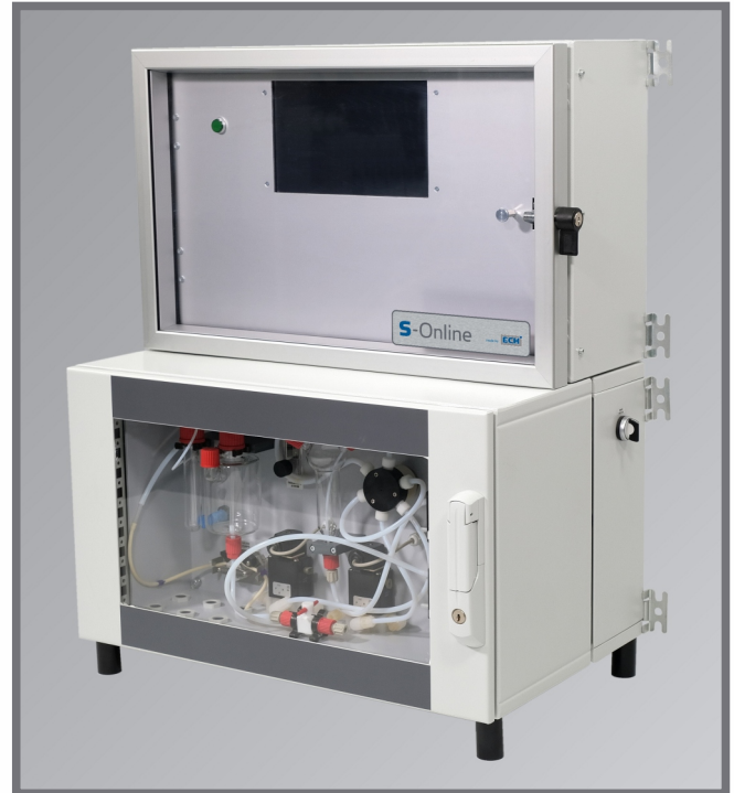
S-Online for online measurement of sulphide/H 2 S

S-Online can be used as a H 2 S dependent controlling system for chemical wastewater treatment. The results can be transferred through digital alarm- and analog outputs into the measuring station.